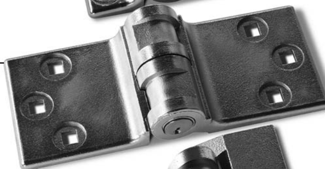
Model 50-2 RH QFR (Freezer lock)