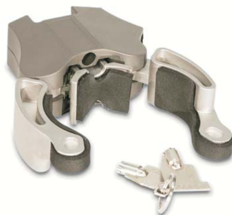
X-Lock Gun Lock