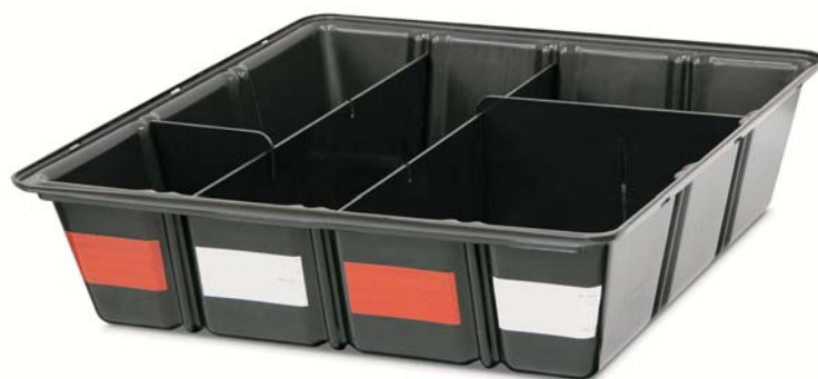
Replacement Divider Kit - 36-110 KIT $99.99