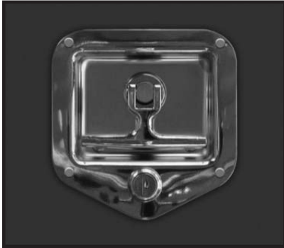
Standard T-Handle Keyed Lock (No extra cost)