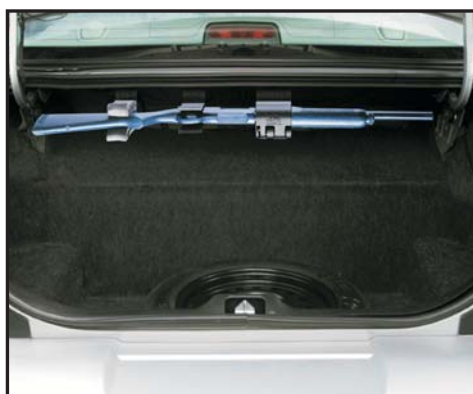
Trunk Mount (can be mounted in multiple positions within trunk)