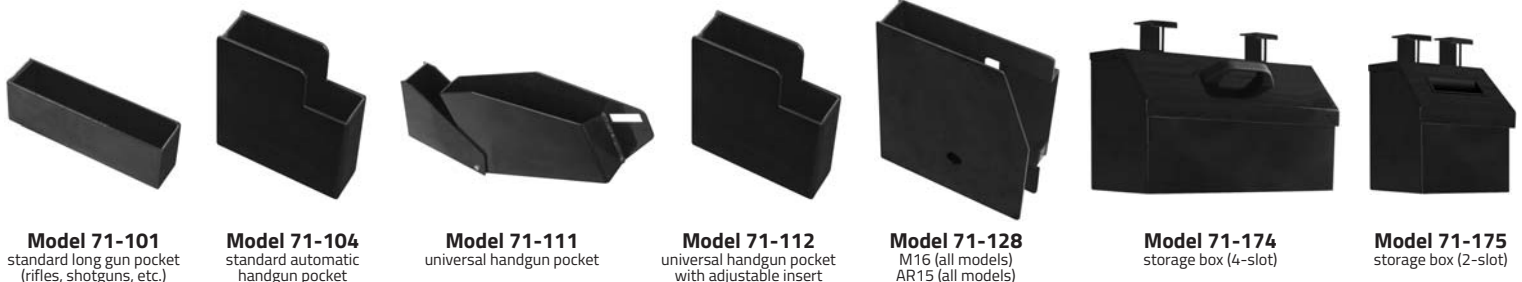
Model 71-101 standard long gun pocket (rifles, shotguns, etc.)

Additional pockets available. Contact Customer Service for gun pockets not listed.