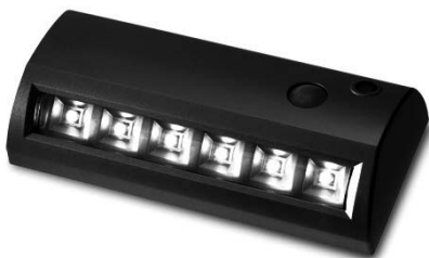
Motion-Activated Interior LED Light $29.95