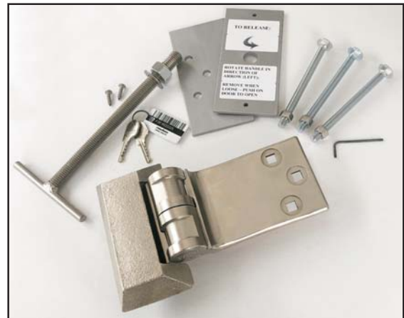
Freezer kit includes two keys, back plates, carriage bolts, t-handle, screws and hex key