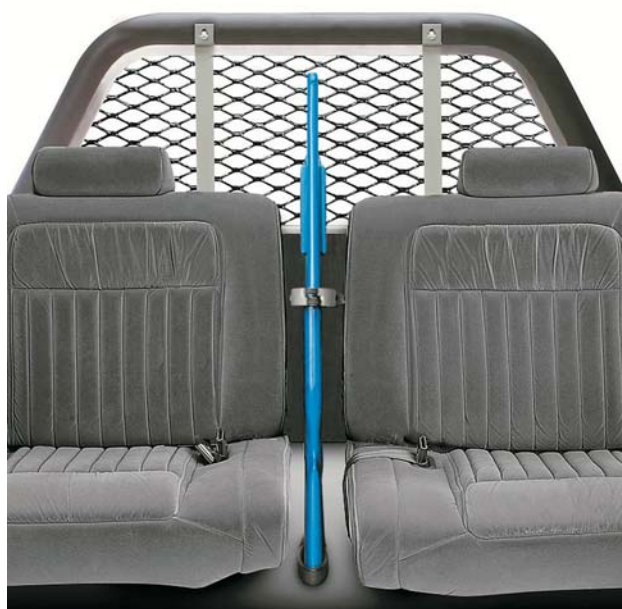
Single Gun Vertical Mount

54-700 HK (Handcuff Key) 54-700 TK (Tubular Key)