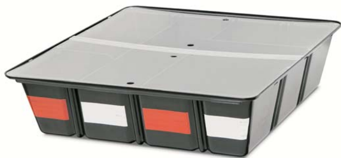
Hinged Cover - 36-120C Clear