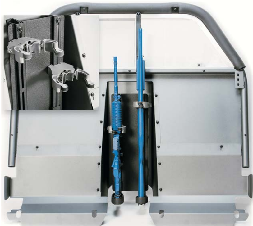
Two Gun Vertical Mount