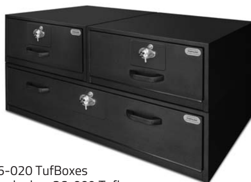
36-020 TufBoxes stacked on 36-009 Tufbox

Note: TufBox Bases, Accessories and Bin sold separately.