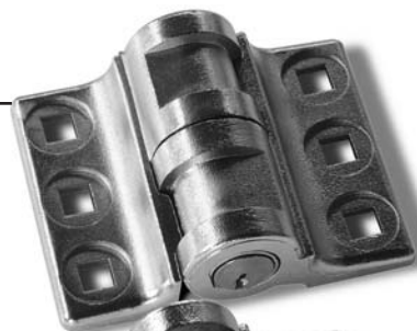
Model 50-2 LH (1 long, 1 short wing)