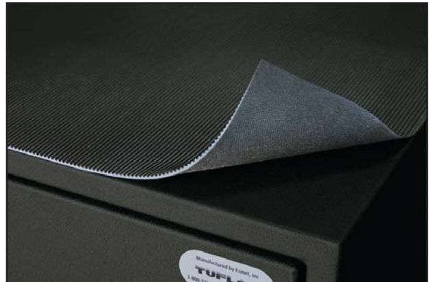
Exterior Protective Rubber Mat