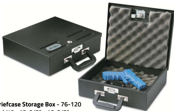
Briefcase Storage Box - 76-120 3-1/4" x 12-3/8" x 10-5/8" $249.95 Combination lock with key override