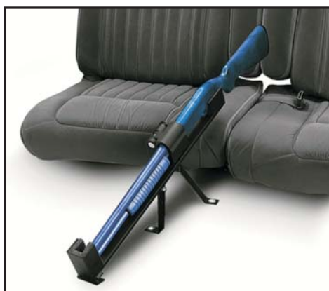
Muzzle Down Mount