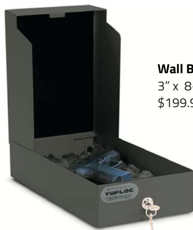
Wall Box - 73-601 3" x 8-1/8" x 14-1/8" $199.95 Key lock cylinder

Contact Customer Service for guns not listed.