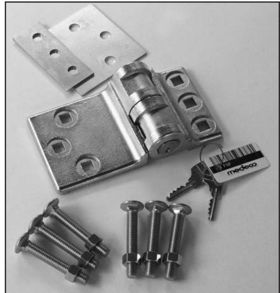
Kit includes two keys, back plates and carriage bolts