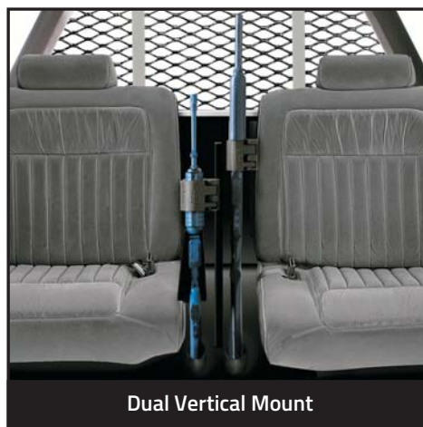
Dual Vertical Mount