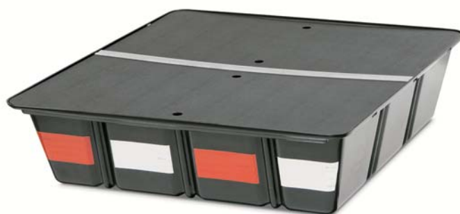
Hinged Cover - 36-120B Black