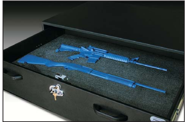
Interior Gun Foam