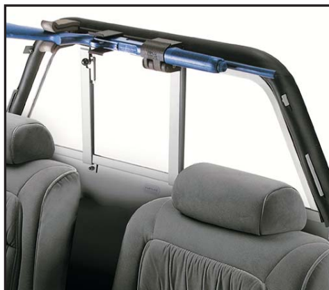
Roll Bar Mount