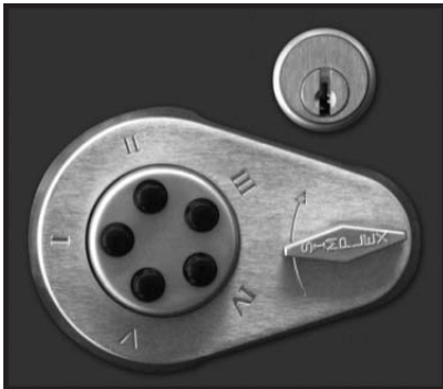
Combination with Key Override $199.95