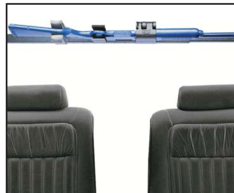
Overhead Mount (for vehicles with no partition)